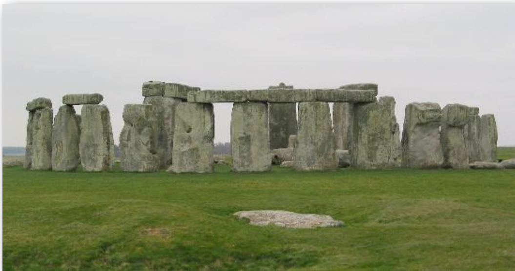
STONEHENGE , to which Amesbury is the nearest town